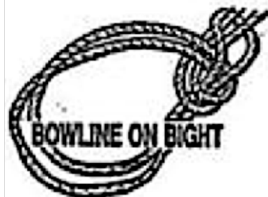
BOWLINE ON BIGHT